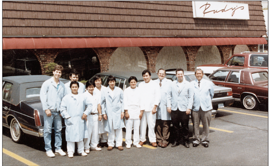
The original staff at Rudy's Inflight Catering worked out of the back of a restaurant, but would soon be in the forefront of the business aviation catering industry.

In their first year, the brothers were producing meals for approximately 16 aircraft a week. A year and a half later, they were doing 15 to 20 aircraft a day, operated two vehicles and had six employees — three of whom still work for them — and were fast outgrowing their backroom space. Two other facts helped motivate a search for their own digs. First, NetJets wanted to contract with a caterer, but said the brothers would have to grow their services and capabilities substantially if they hoped to win