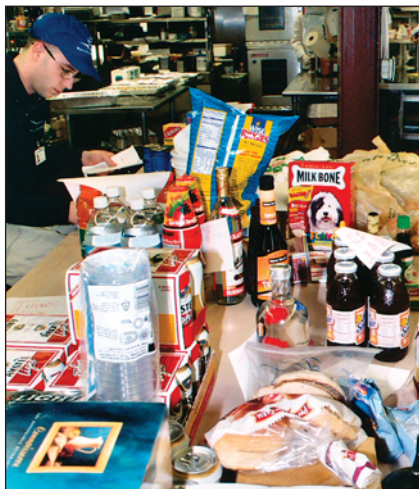
From special brands to dog treats, Rudy's' policy is, "You want it, we'll get it for you."

be exposed to contamination, and establish a procedure unique to a specific operation.